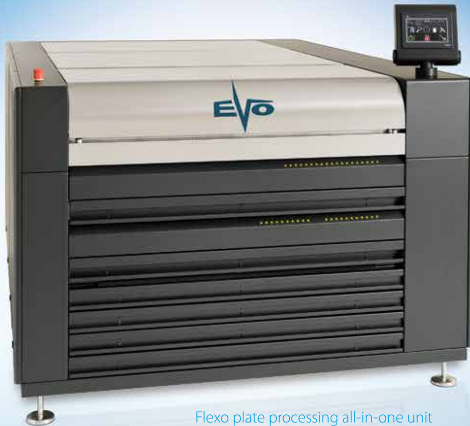
Flexo plate processing all-in-one unit